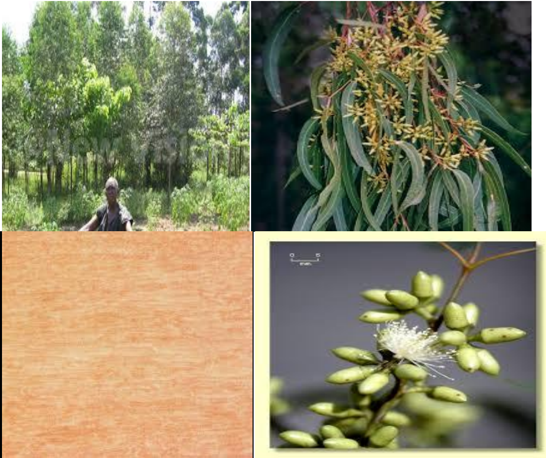
Eucalyptus tereticornis Sm.