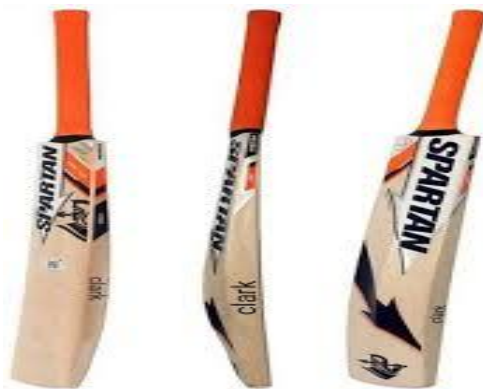
Articles made from wood of Salix alba

Botanical name: . Eucalyptus tereticornis Sm.